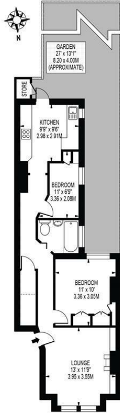
GROUND FLOOR FOR ILLUSTRATION PURPOSES ONLY

APPROXIMATE GROSS INTERNAL FLOOR AREA: 580 SQ FT - 53.88 SQ M (INCLUDING RESTRICTED HEIGHT AREA & EXCLUDING STORE) APPROXIMATE GROSS INTERNAL FLOOR AREA OF RESTRICTED HEIGHT: 14 SQ FT - 1.28 SQ M